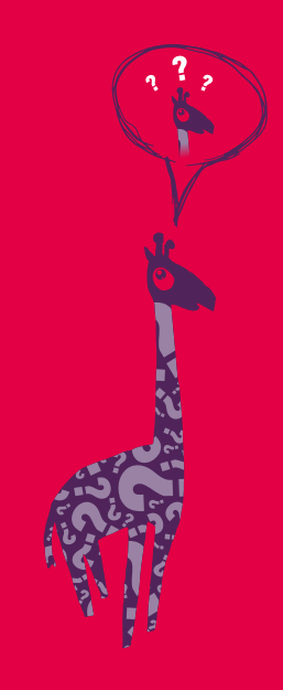
Why giraffes? For a story about giraffes, check www.ices.hr